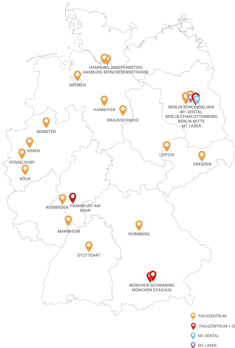
Figure 3: M1 Kliniken AG clinic network in Germany