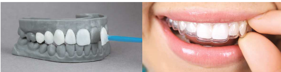
Figure 4: Overview of M1 Dental’s ceramic veneers (left) and transparent braces (right) for teeth alignment