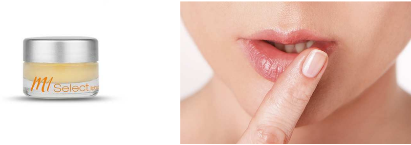
Figure 5: M1 Select's lip booster product